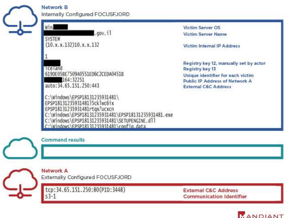
Figure 3 - Two FOCUSFJORD samples configured to proxy C&C traffic

While hunting for FOCUSFJORD samples, we found a sample of a new malware (MD5: 625dd9048e3289f19670896cf5bca7d8) that shares code with FOCUSFJORD, but is distinct. However, analysis indicates that it only contains functions to relay communications between another FOCUSFJORD instance and a C&C server (Figure 2, Network A). We suspect this type of malware was used in the above-mentioned operation. The actors stripped out unnecessary FOCUSFJORD capabilities, possibly to reduce the likelihood it would be detected by security controls. Figure 3 below contains the data structure as it is being sent from a FOCUSFJORD sample configured to communicate with another FOCUSFJORD victim.