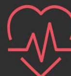
Healthcare & Life Sciences