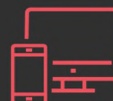
Technology, Media & Telecoms