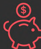
Asset Management & Investment Funds