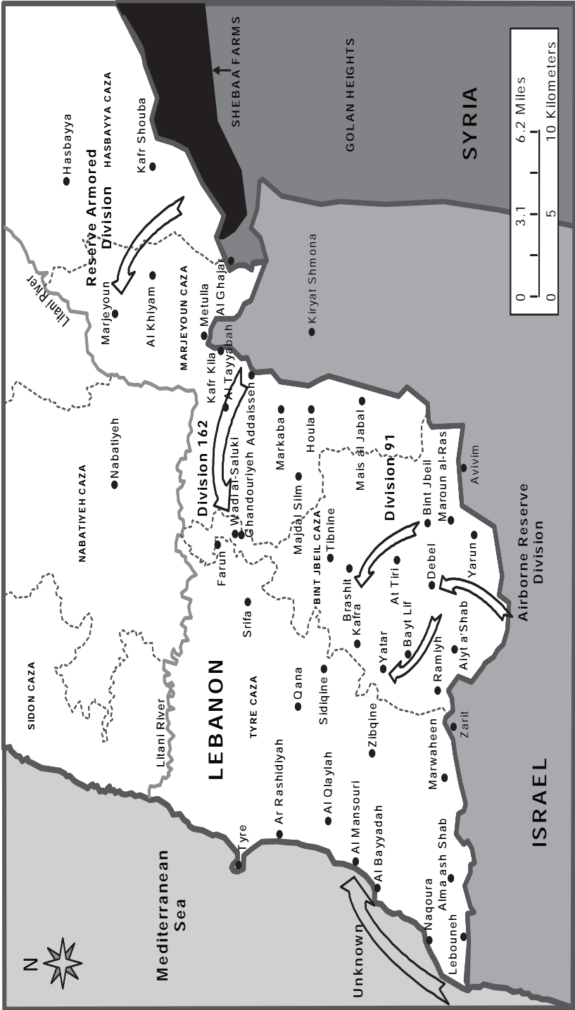
Map 4. Drive to the Litani